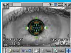
Auto alignment / auto shot

If you choose the multi shot option the system produces up to three air pulses in an extremely short sequence (0.1 seconds each).