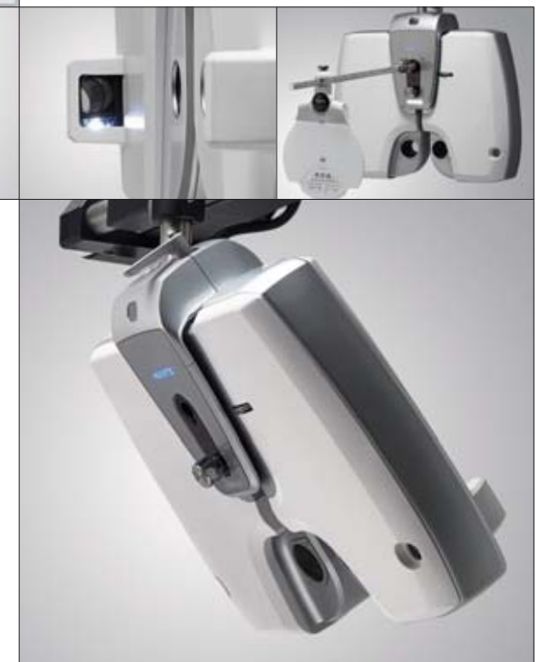
Tiltable Refractor Body

Customized exam is available for those who have different monocular heights within adjustment +/- 3mm.