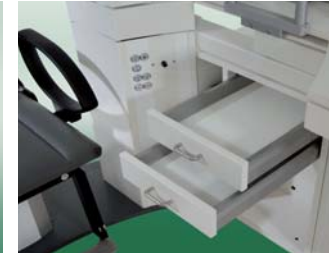
Container, 2 pull-out drawers (with feed damper) (a lot of storage space e.g. for small parts and Reading Charts), below box for Tower PC.