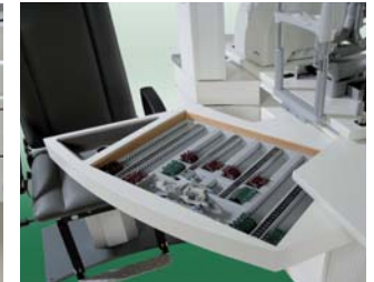
Drawer for Trial Lenses, swivel-mounted, for „large“ trial lens set max. 247 lenses / broad rimmed.