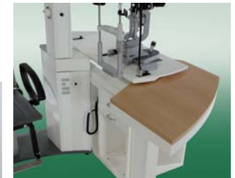
Small Desk Top ca. 650 x 700mm (e.g. Multiplex "beech").

Standard Desk 1300x 650mm, open storage shelf, stable pedestal (L-De- sign) , swivelling drawer for trial lenses (for „large“ trial lens set max. 247 lenses / broad rimmed).