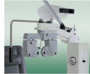
Pendulum-Phoropter Bracket manually operated (Option with electric drive)