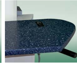
Handle for ergonomic motion of the swivelling instruments table.