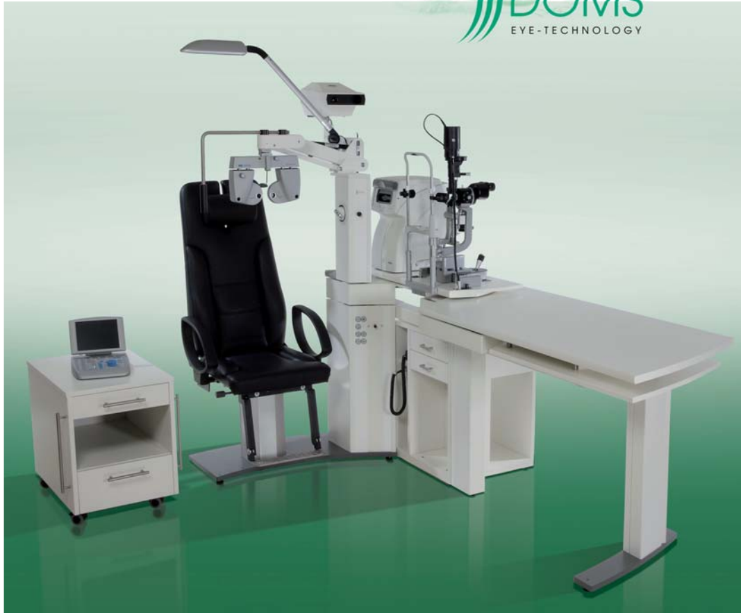
DOMS CONCENTRIC with Centric chair and desk 1300x650mm

DOMS CONCENTRIC meets the high quality standards imposed by the DOMS philosophy: