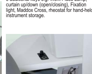
Spectacle Storage for Patient Glasses, besides the patient chair.