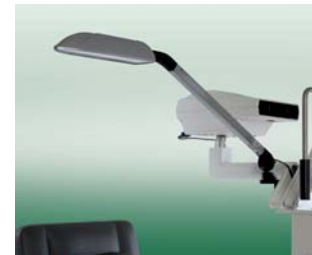
Big Work Place Lamp adjustable hinge, 15 W fluorescent lamp.