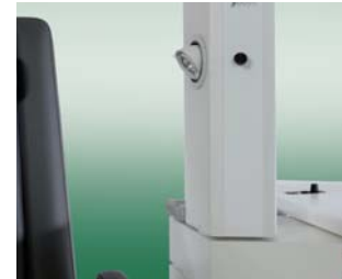
Halogen-Spotlight 20 W The on/off switch is integrated into column, pull-out lamp head.