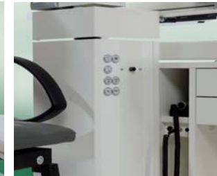
Control Panel illuminated, Hand-held Instrument storage handily placed, switching functions at the front side of the column: Unit on/off, chair automatic down, upgradeable with 5 additional keys e.g. Work Place Lamp, curtain up/down (open/closing), Fixation light, Maddox Cross, rheostat for hand-held instrument storage.